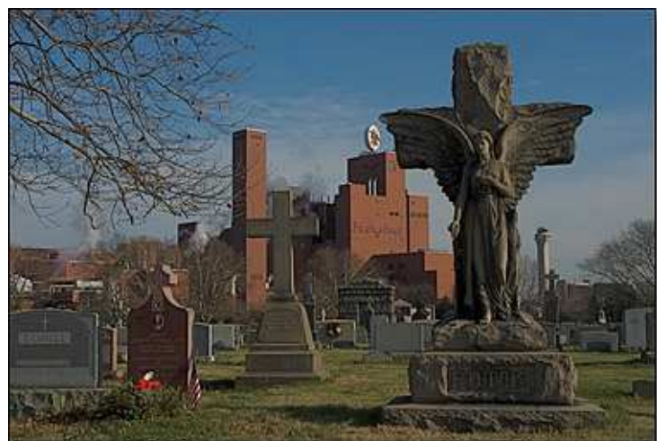
Dreaming in Stone

Grounds For Sculpture, 18 Fairgrounds Road Hamilton, NJ 08619, (609) 586-0616