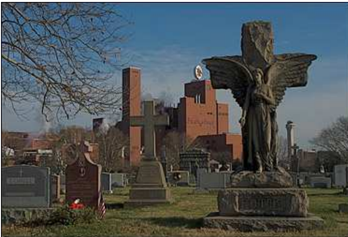
Dreaming in Stone