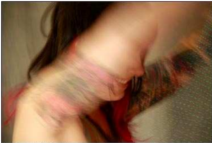
Dancing With Beads

SEND YOUR NEWS AND SUGGESTIONS VIA THIS DIRECT PATH TO THE EDITOR .