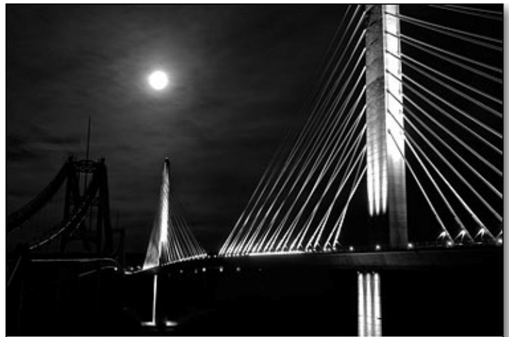
Bridge Moon Bridge