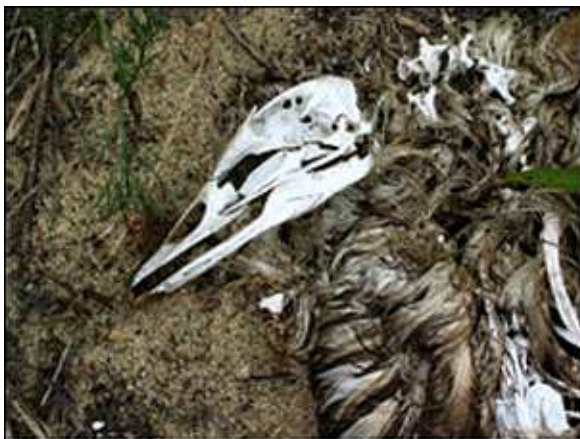
Feathers & Bones

See Members News, Vol. 2011_11 for other images. Congratulations to all our Silva Gallery exhibitors!