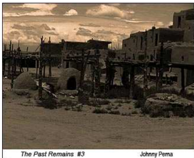
The Past Remains #3