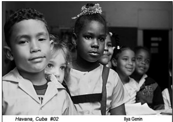
Havana, Cuba #02

"Congratulations! Your entry in the B&W Portfolio Contest 2011 has been selected for a Spotlight Award . A total of 24 entries were selected for this honor. These will be included in future issues of B&W + COLOR Magazine, spread across 4 issues published in 2011-2012. Your photography and a short essay on you and your work will be published as a multi-page feature. ... "