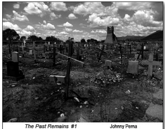
The Past Remains #1