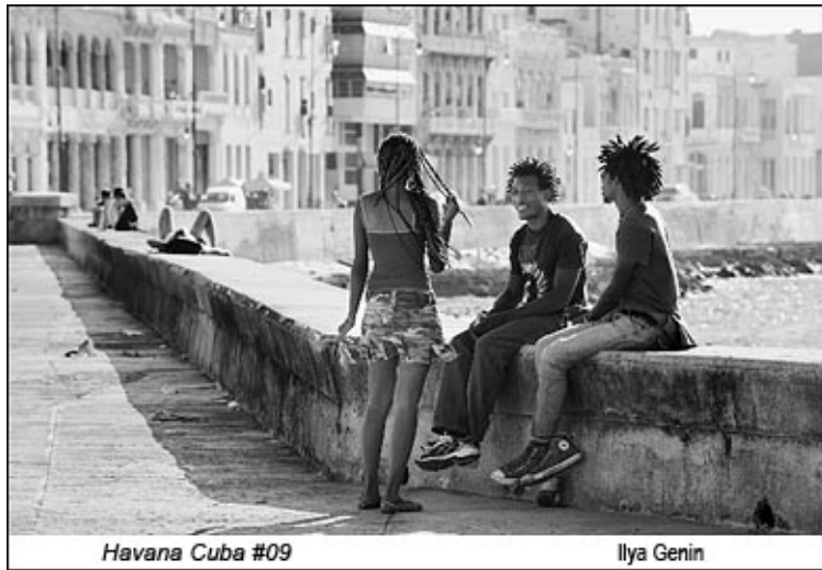
Havana Cuba #09