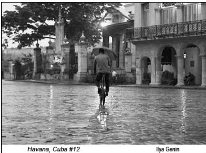
Havana, Cuba #12