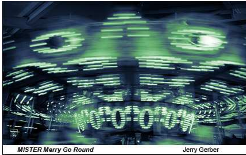
MISTER Merry Go Round

Several of us have two or three images in the show, but because of the large number of images, we show only one per photographer for this exhibit. As always, if you want to see all the photos at their best, get ye to the exhibit!