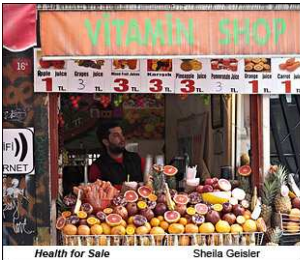
Health for Sale